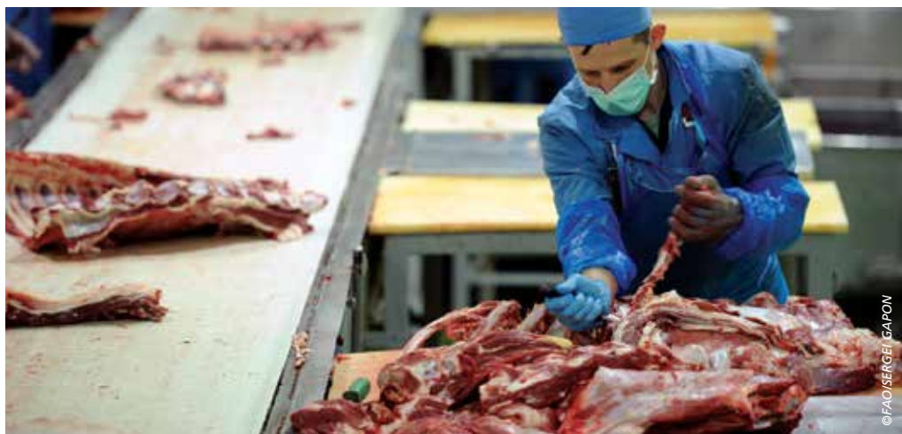
Codex Alimentarius food hygiene standards should be followed to prevent contamination of food products

Biosecurity guidance for specific settings can be found in FAO and partners' publications .