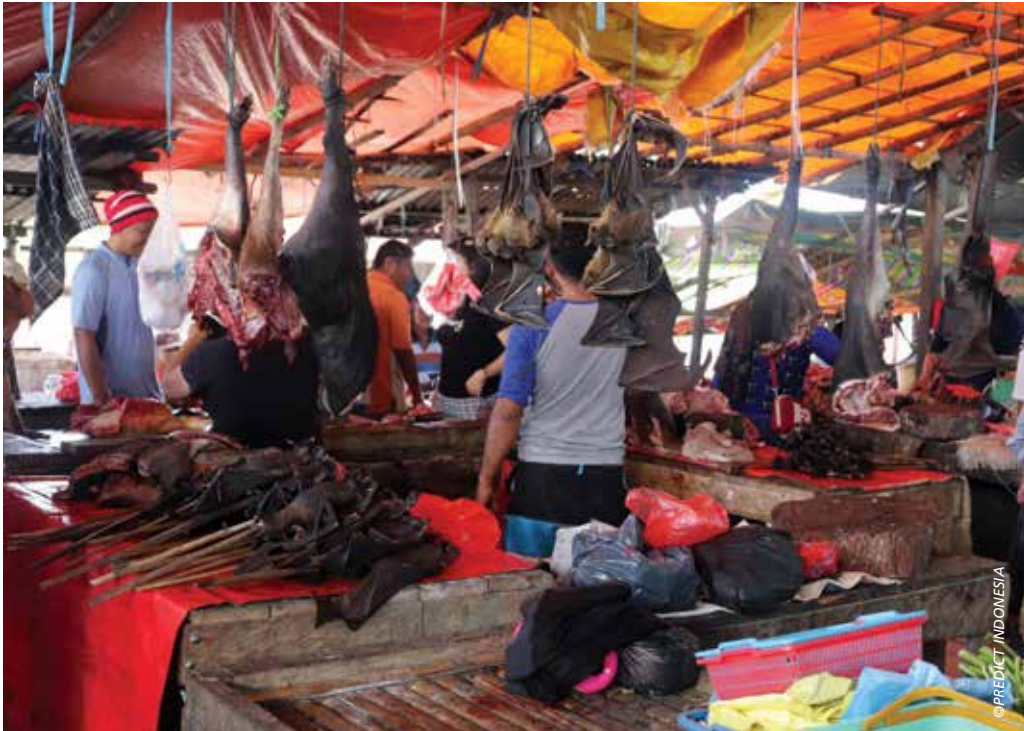
A traditional market selling wild meat, Indonesia