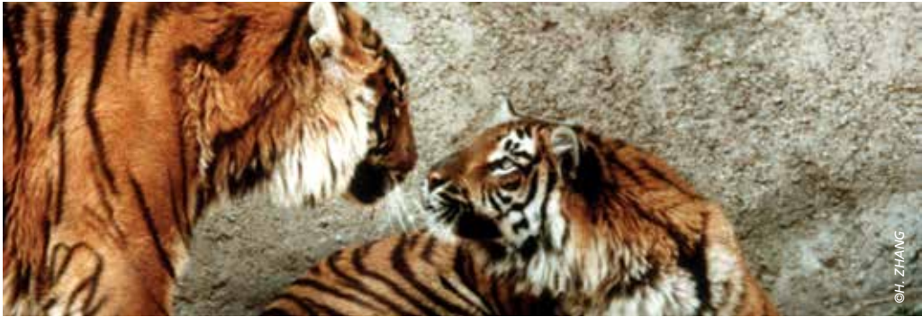
SARS-CoV-2 transmission to tigers from their caretaker was confirmed in Bronx Zoo, New York