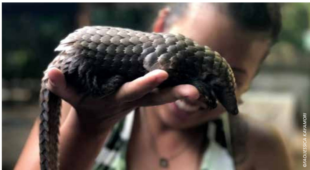
A SARS-related coronavirus has been detected in pangolins

FAO received several requests from member countries to provide advice on surveillance or testing for SARS-CoV-2 in animals which led to the review of available information on SARS-CoV-2 and betacoronaviruses in animals. This qualitative exposure assessment aims to support One Health partners, including veterinary services and research institutions, in prioritizing animal species for targeted field investigations or research studies aimed at generating data and knowledge on potential SARS-CoV-2 animal host(s) and their role in maintenance and/or spread of the virus. The assessment is based upon review of information available up to 30 June 2020 and will be revised as circumstances change and new information becomes available. The reader should note that the uncertainty in the assessment of the different levels of likelihood remains generally medium to high since there is a need for a better understanding of SARS-CoV-2 characteristics and the epidemiology of infection to provide a more precise assessment.