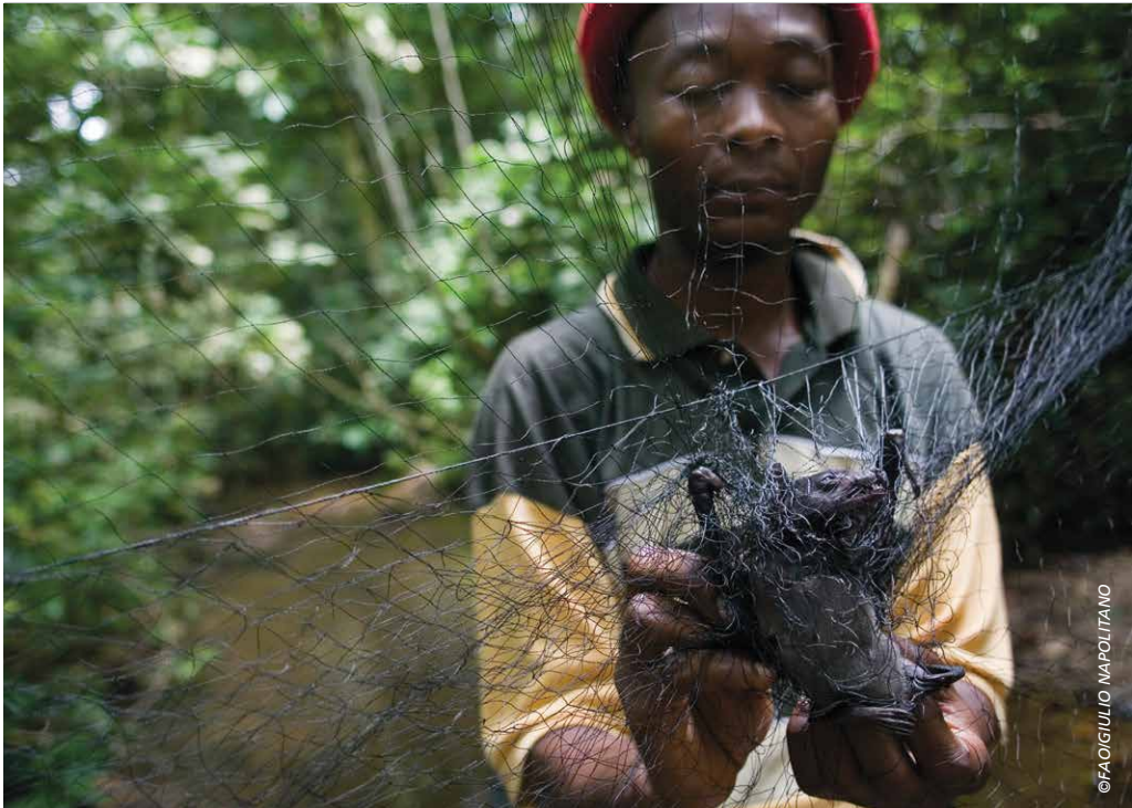
Capturing bats for research, Democratic Republic of the Congo

between humans or domestic animals, and bats or other susceptible wild animals that might act as bridge species – will lead to evidence-based actions which reduce the likelihood and impact of future emergence and spillover of zoonotic pathogens with pandemic potential. Maintenance of strict biosecurity measures, respecting standards of the Codex Alimentarius basic texts on food hygiene (CAC, 2009), wildlife trade controls and restrictions, with bans on illegal trade, and/or behaviour change in consumers and traders would require additional medium- to long-term engagement. Such measures, as informed by national risk assessment, should take into account impact on livelihoods and food security. The assessment is based upon information available up to 30 June 2020 and will be revised as circumstances change and new information becomes available.