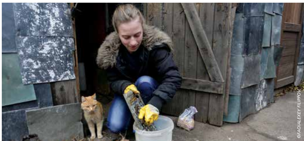
Detailed investigation of SARS-CoV-2 transmission mechanisms between humans and animals is a research priority