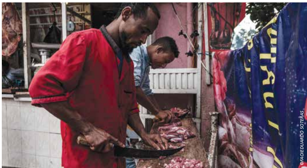
Men cutting meat in a butchery, Addis Ababa, Ethiopia

SARS-CoV-2 in animal species that would distract time and resources away from other responsibilities of veterinary services. FAO encourages public health, veterinary, forestry and natural resources management and wildlife authorities to work closely together under the One Health approach to systematically investigate SARS-CoV-2 infected humans for history of contact with animals and animal products and conduct targeted, robust epidemiological investigations coupled with laboratory testing for animal species potentially linked with COVID-19 human cases, provided conditions and resources allow (see Suggested Approaches for Field Investigations in Animals).